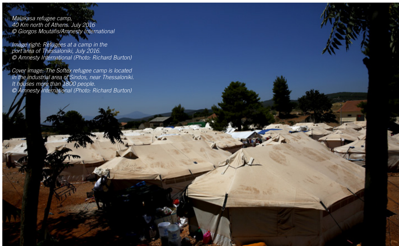
Cover image: The Softex refugee camp is located in the industrial area of Sindos, near Thessaloniki. It houses more than 1800 people.