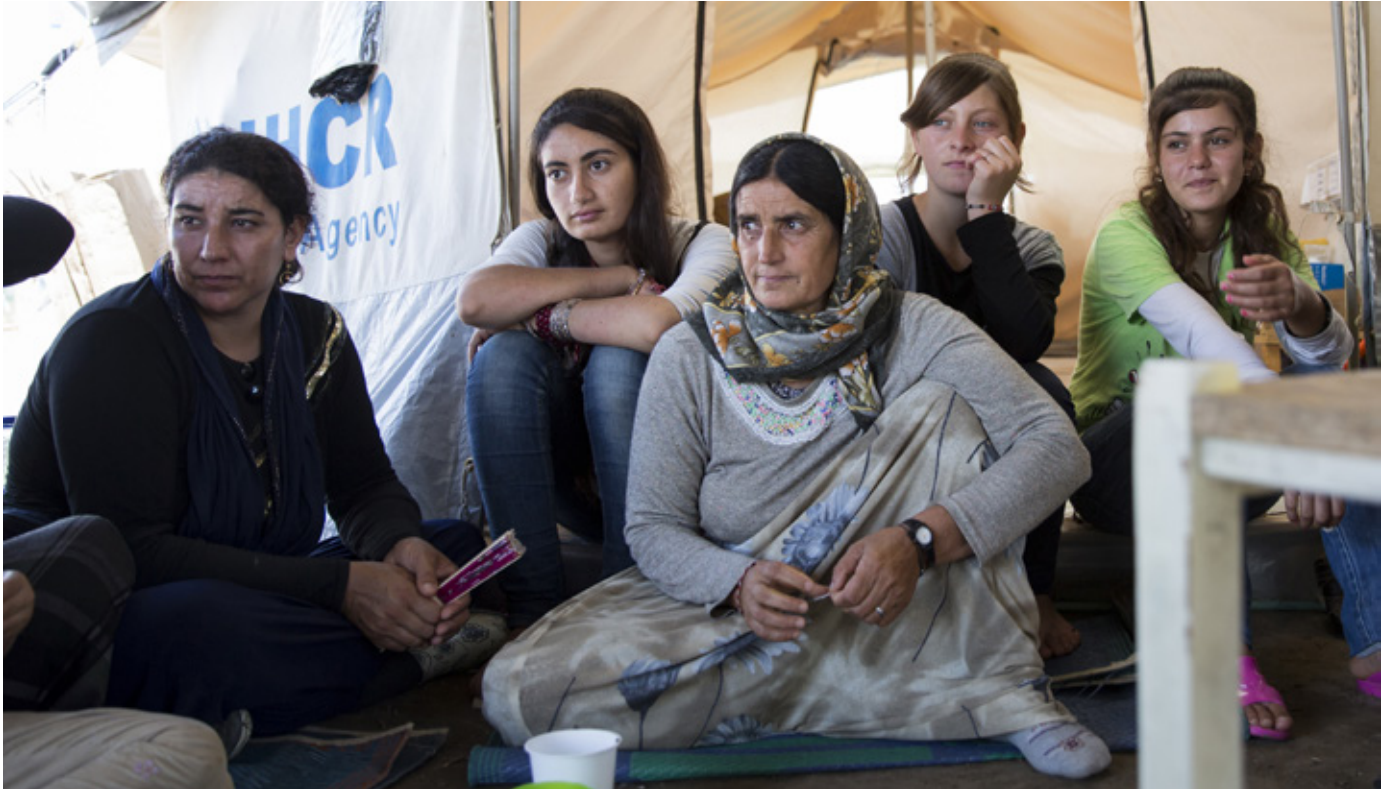
Image below: Yezidi women have survived brutal abuses by IS, travelled thousands of miles to escape, but now find themselves overlooked by European leaders. July 2016.