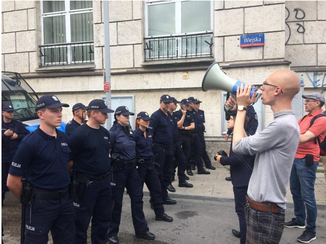
Police cordoned off an access road to the Parliament, Wiejska Street, at one end on 20 July 2017. Activists called on the police to release the protesters who were apprehended after they climbed through the fences separating the street from the area around Parliament.

An activist who did not participate in the protest and was standing on one of the exit roads taking pictures stated that the police physically assaulted her: “I was just standing there and one police officer grabbed me without any warning and pushed me against a traffic light post. He hit me in the face. I wasn’t resisting... After that, more police officers came to the site, they completely blocked Górnośląska Street and kettled me there.” 17 The police subsequently told the media that the activist did not have any evidence to support her allegations of police abuse. 18