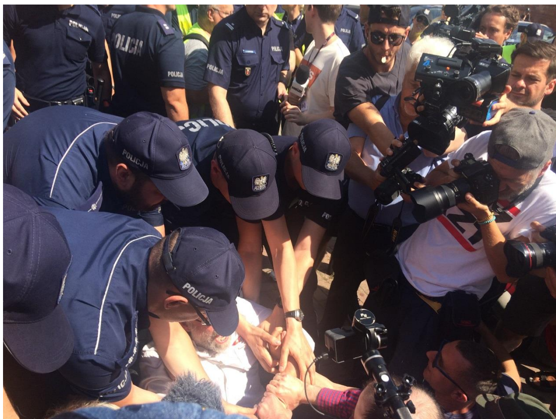
Police intervened in a peaceful spontaneous assembly at the headquarters of the Law and Justice party on Nowogrodzka Street on 24 July 2017. The assembly was not obstructing traffic and the police initially refused to provide grounds for the intervention against the protesters.

On 24 July during a spontaneous assembly at the headquarters of the Law and Justice party on Nowogrodzka Street, about 30 to 40 persons from a civil society group, Obywatele RP, and other groups held a protest under a banner that read “Free Courts, Free People”. 38 The protesters gave speeches with the use of a microphone with loudspeakers and a megaphone.